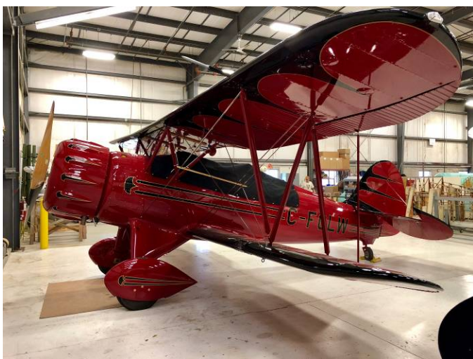
NEW YMF-5D for customer in Canada