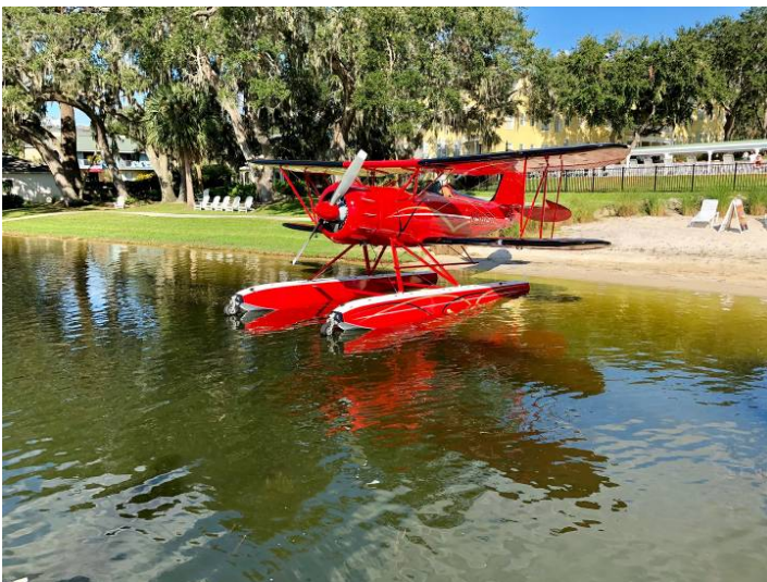
Lakeside Inn, Mt, Dora Fl.

http://seaplanemagazine.com/2017/11/18/flying-the-waco-ymf-5f-floatplane/