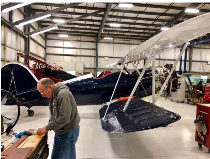
NEW YMF-5D—waiting on new G500TXi to arrive