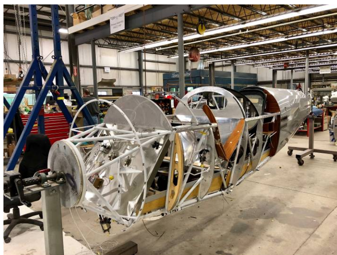
NEW YMF-5D - Landing gear tomorrow !