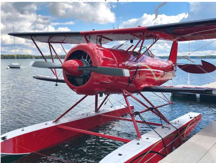
Gull Lake Yacht Club, Richland, Mi