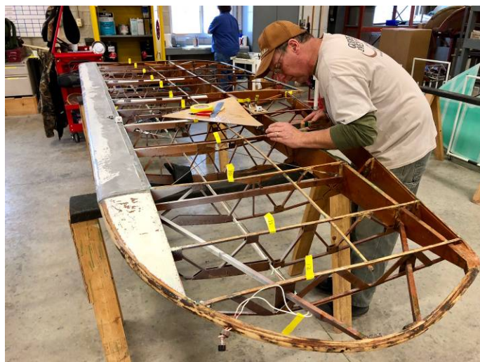
1930's Wings getting repaired and updated.

Great Video of a NEW Great Lakes going together at the WACO Factory.