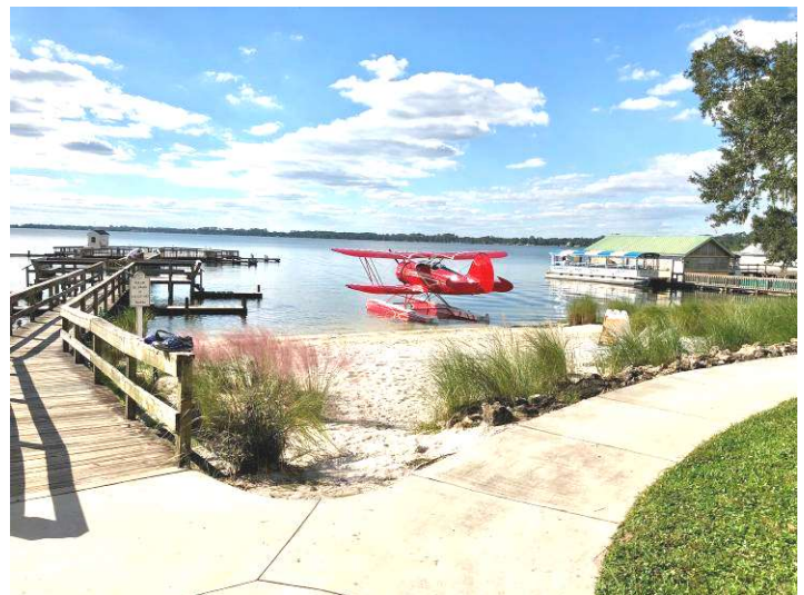
Lakeside Inn, Mt, Dora Fl.