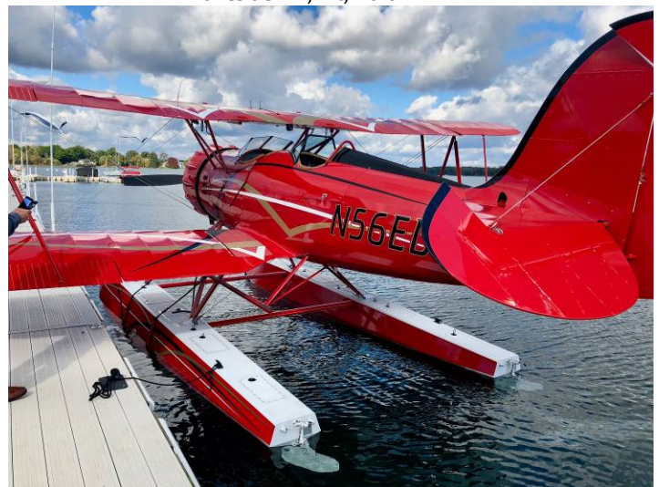
Gull Lake Yacht Club, Richland, Mi